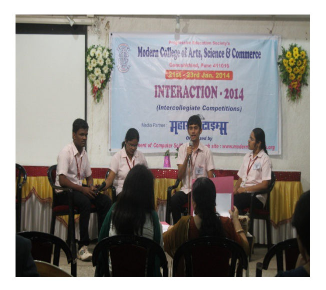
Guest Discussion at Group Discussion Competition