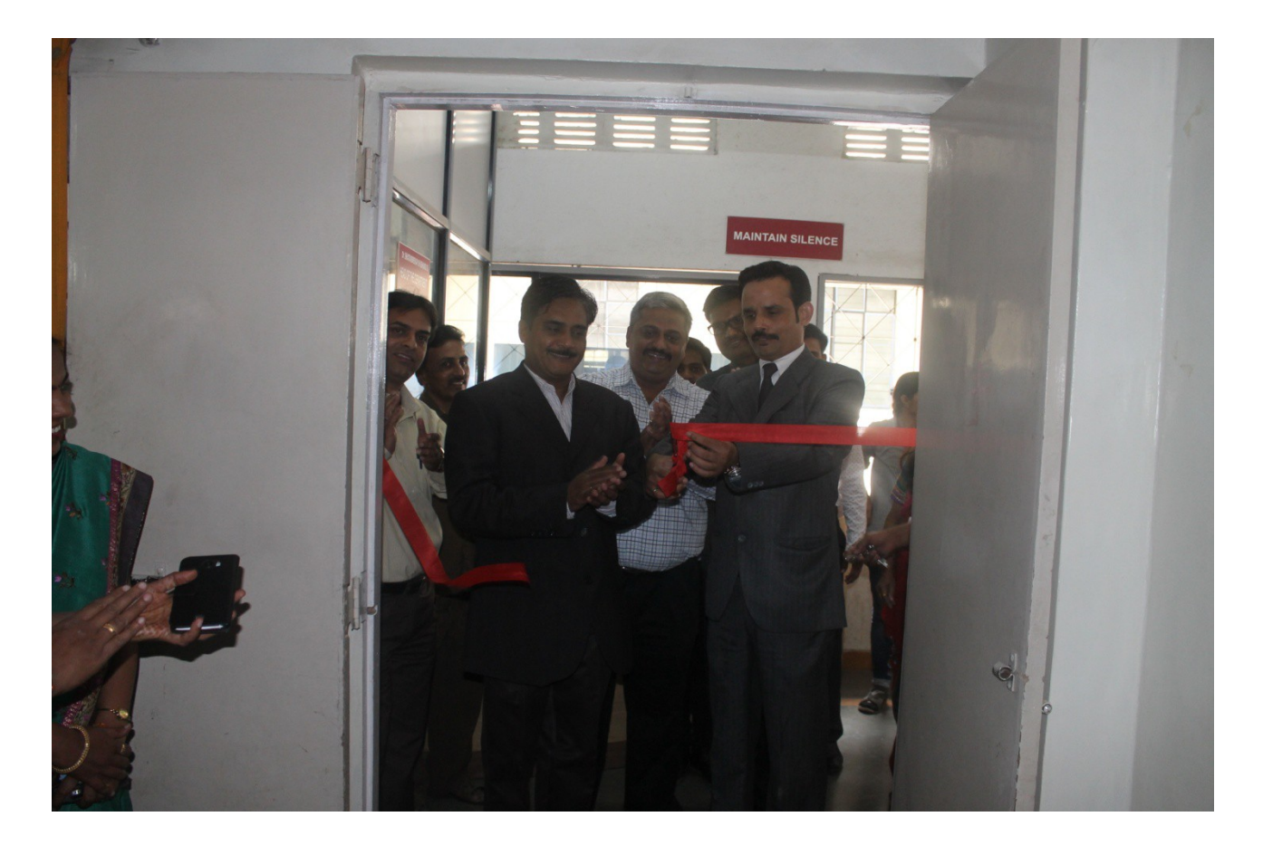
Inauguration of Interaction 2014 1<sup>st</sup> Online Programming event by our Chief Guest