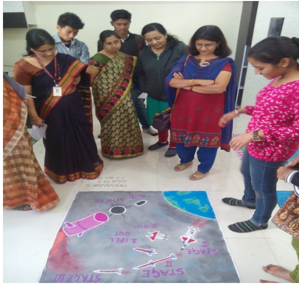
Launching Satellite ( physics rangoli)