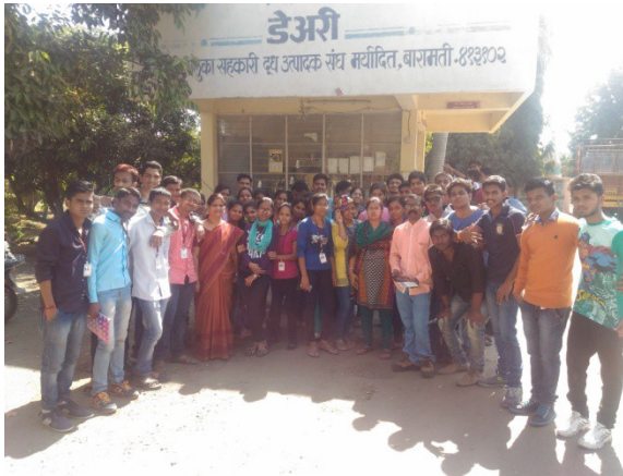
Study tour- F. Y. B Sc