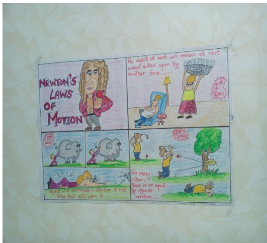
Laws of motion