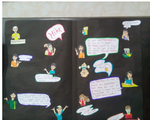
use of Electromagnetic spectrum